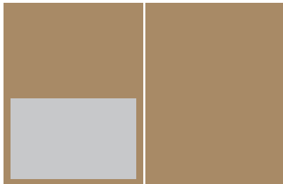
Half Page: 7.875" x 5.0625"